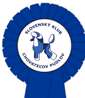
intermediate, open, champion class