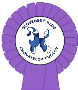
minor puppy class