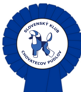
intermediate, open champion